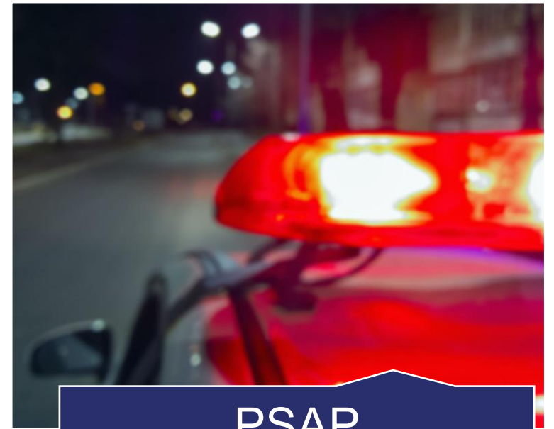
PSAP (911 Dispatch)